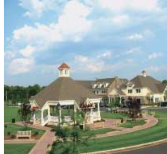
Redevelopment Community, Dewey Meadow Village Basking Ridge, New Jersey