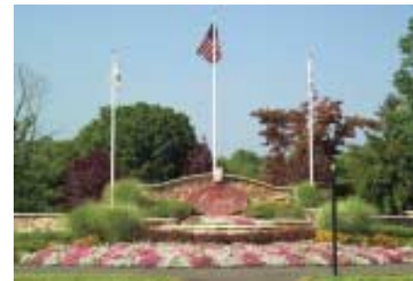
Canal Walk, Somerset, New Jersey From gazebo to putting green and well beyond, elegant recreation is redefined. Breathtaking indoor and outdoor pool areas evoke the ambience of fine cosmopolitan resorts.

With numerous active adult communities underway, Premier makes it their business to understand local active adult markets. Multiple product types offer choices to buyers on every level, including condos, townhomes, single family homes and rentals. From design preferences to social programming to comprehensive maintenance, Premier's communities respond to the marketplace, and the results speak for themselves.