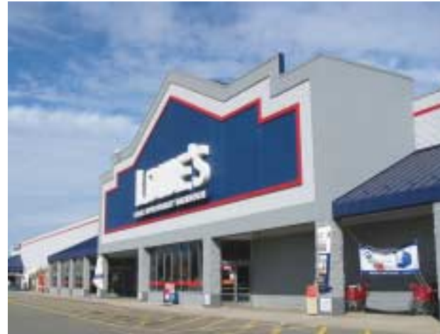
Centennial Square, Piscataway, New Jersey

Premier is recognized for outstanding commercial and retail development. Its principals were instrumental in developing regional shopping centers as large as 500,000 square feet each, with national tenants such as WalMart, Lowe's and Office Max. Premier's retail clusters are known for their design, access and appeal—consequently, they compare favorably with America's finest. Premier commercial and retail developments enjoy high occupancy rates as a result of cultivating successful, long-standing landlord-tenant relationships.