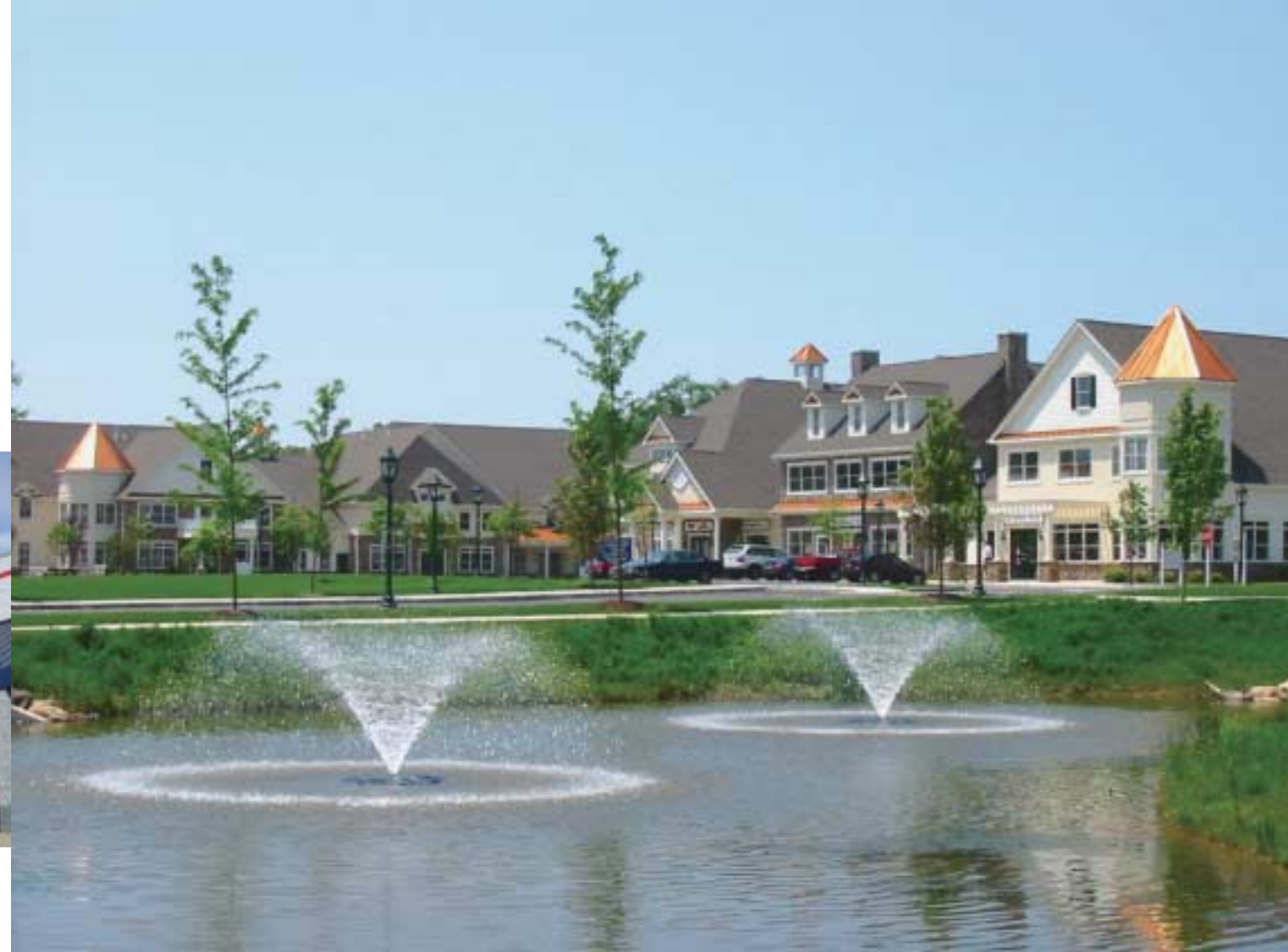
Opposite: Dewey Meadow Village, Basking Ridge, New Jersey