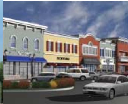
Raritan Town Square, Raritan New Jersey