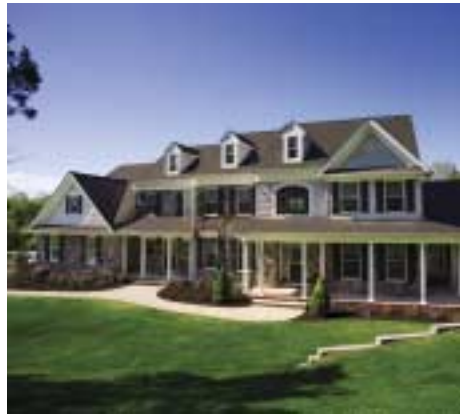
Single Family Home, Meadowview Branchburg, New Jersey

Retail Stores, Centennial Square Piscataway, New Jersey