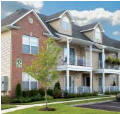
Green Hill Manor, Franklin Park, New Jersey Spacious master suites are a signature in every residence Premier builds.

Premier's rental communities feature an array of variably sized floor plans with sophisticated and smart designs. Interior amenities transcend the ordinary, frequently including washer/dryer units, basement storage, finished attic lofts, lavish finishes and stainless steel appliances.