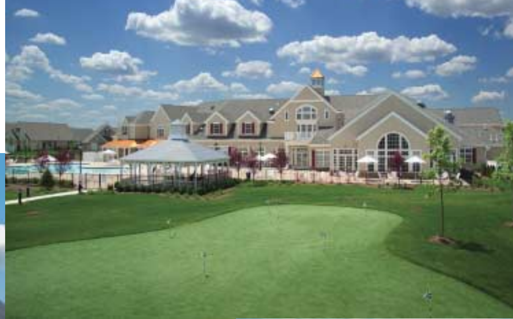
Active Adult Clubhouse, Canal Walk Somerset, New Jersey