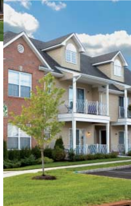
Rental Residences, Green Hill Manor Franklin Park, New Jersey