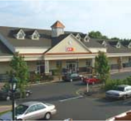
Dewey Meadow Village, Basking Ridge, New Jersey

Premier is recognized for outstanding commercial and retail development. Its principals were instrumental in developing regional shopping centers as large as 500,000 square feet each, with national tenants such as WalMart, Lowe's and Office Max. Premier's retail clusters are known for their design, access and appeal—consequently, they compare favorably with America's finest. Premier commercial and retail developments enjoy high occupancy rates as a result of cultivating successful, long-standing landlord-tenant relationships.