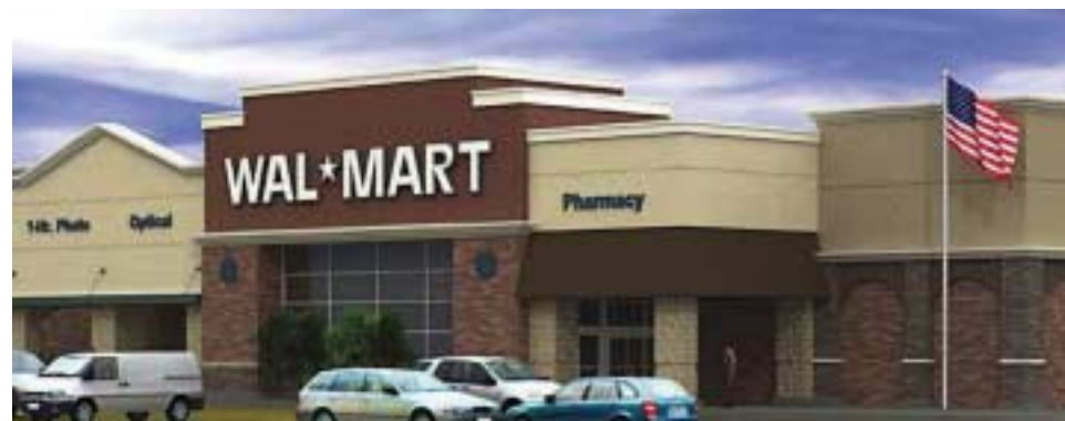
Raritan Town Square, Raritan New Jersey

Successful redevelopment requires exceptional vision, resources and expertise. Premier has the vision to imagine the possibilities for abandoned, contaminated or underutilized sites, and the capability to redevelop them for new use. The company has the financial resources required to see projects from start to finish; in-depth knowledge of environmental issues, approvals and regulations; and the engineering and planning expertise crucial to turning these sites around. While extensive and complicated, redevelopment is a uniquely satisfying endeavor, and they take great pride in their achievements in this field.