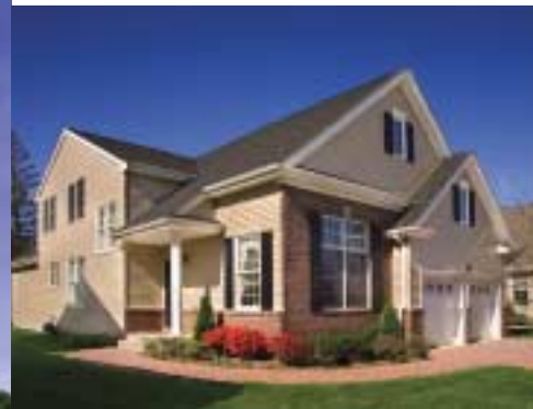
Canal Walk, Somerset, New Jersey Signature Premier sophistication and prestige—simply the ultimate in style.

Premier embraces its reputation as a pioneer in active adult development. Having successfully completed numerous active adult communities, today Premier is focusing its efforts on Canal Walk, Gateway at Roycebrook, Summerfields at Franklin and Brandywine Woods—four projects in various stages of approvals, development and construction that will further Premier as a leader in the active adult market.